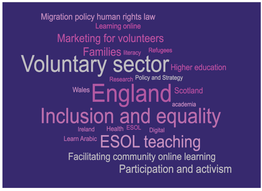
Figure 2: Topics of resources recommended by respondents for staff and volunteers